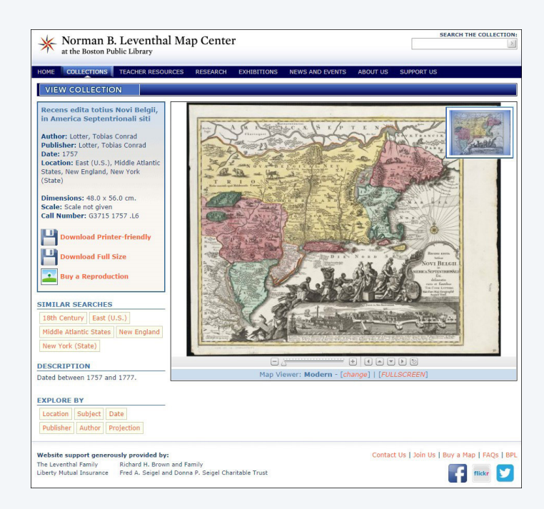
Figure 2. Screenshot of the Norman B. Leventhal Map Center's website.

In addition to the LMC's collection, agreements have been made with other institutions such as the American Antiquarian Society, Boston Athenaeum, British Library, Harvard Map Collection, Library of Congress, New York Public Library, and Newberry Library, as well as private collectors, to include American Revolution Era primary source material from their map collections within the LMC's website. This has been done in an effort to promote digital philanthropy, diversify the digital collections, and provide an access hub for historical maps. So far, the number of these types of items included in the LMC's digital collections is over 1,050 maps.