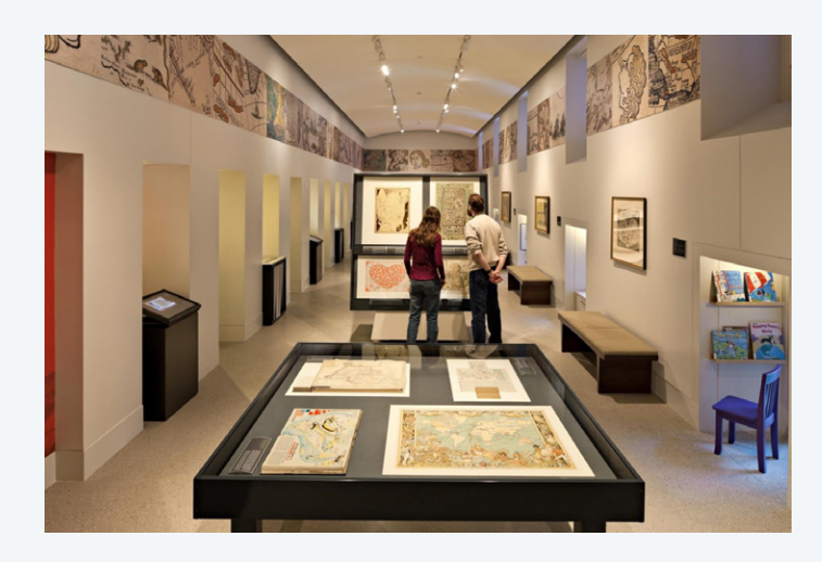
Figure 1. Visitors enjoy the Norman B. Leventhal Map Center Gallery.

appointments are suggested, the LMC often accommodates casual researchers who have serendipitously become