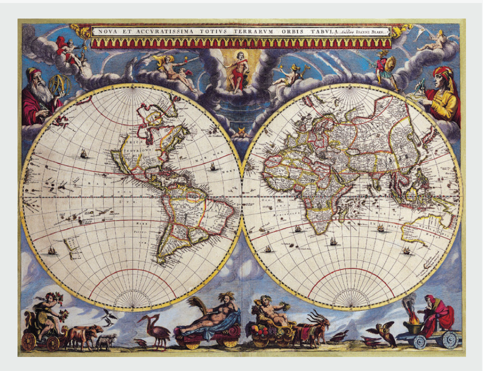
Figure 8: Joan Blaeu's Nova et Accuratissima Totius Terrarum Orbis Tabula. This is the form that Blaeu's double-hemisphere map took in his Atlas Maior (1662–1672: vol. 1, pl. 1), praised by H. de la Fontaine Verwey as "the greatest and finest atlas ever published" (quoted in Van der Krogt 2005, 34). At only 40 \times 54 cm ( 15\frac{1}{2} \times 21 in) (Shirley 2001, entry 428, pl. 315), Nova et accuratissima totius terrarum orbis tabula is dwarfed by Joan's 1648 map, whose twenty sheets together total 205×299 cm (nearly 7 \times 10 ft). In fact, the Atlas Maior world map was "not directly taken from the large original of 1648 but [was] copied from one of his competition's reductions" (450). Nevertheless, like its more scientific-looking predecessor, this ornate and highly reproducible atlas map also refers to Australia as Hollandia Nova (New Holland) and its coasts similarly "suggest the real shape of the western part of that continent" from the Gulf of Carpentaria in the northeast to the Great Australian Bight in the south (Wieder 1925–1933, 3:62). The Southern Continent hypothesized by the ancient Greeks has disappeared, but so too has any hint of Antarctica. As if to symbolize its place between the old and the new, Joan framed the world between images of Copernicus and Ptolemy, and placed allegorical representations of the planets and the seasons above and below (Van der Krogt 2000, 485). Reproduced from Kyrychok (2012).

[for Joan's 1645–1646 map]). Two years later, Joan included much the same detail from the 1645-1646 revision—along with exactly the same image of Australia (Hollandia Nova), Tasmania (Van Diemens Landt) and New Zealand (Zeelandia Nova)—in his own (enormous and better known) 1648 world map Nova totius terrarum orbis tabula, published on the occasion of the signing of the Treaty of Münster (Zandvliet 1998, 211; see Wieder 1925–1933, 3:61–65, pls. 51–71). Not only was Joan's 1648 map "lauded as the finest expression of Dutch cartography at the highest point of its development,...[but his] world outline ... established a pattern which was followed by virtually all succeeding maps until the last decade of the century" (Shirley 2001, entry 371).