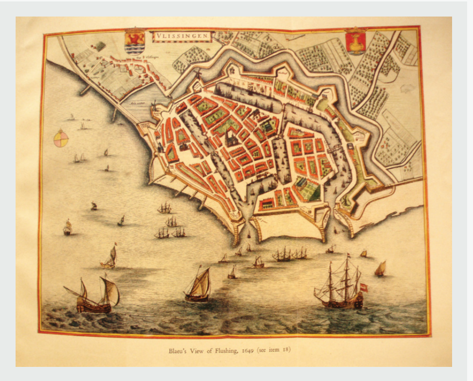
Figure 5: "Blaeu's View of Flushing, 1649," fold-out map from the 1929 Francis Edwards catalogue Old Maps of the World (Francis Edwards 1929, 20). On a 20×23 cm page (8½×9¾ in), the 15×20 cm map (6½×8 in) with its northern orientation is keyed to the final words of item 18 (21; see Figure 4, above): "No modern process can give absolute fidelity to the beauty of the original, but some idea of the scale of the production may be gained by referring to the coloured plate, which is roughly one fifth reduced in size." The original map of Vlissingen, plate 51 iijE in the Dutch edition of "The United Netherlands," measured 41.5×51 cm (16½×20 in) (Van der Krogt 2010, 1542, entry 4736). The Flushing map typifies the other maps of the Town Atlas of the Netherlands, whose presentation is "plain and consistent" (Koeman 1997, 92).

18 is "Blaeu's View of Flushing, 1649" (20), one of only four maps illustrating the catalogue, and the only one in color (Figure 5). In his notebook, Slessor put a question mark beside the words "2: View of Flushing/Vlissingen" (April 3, -s88). The "2" indicates that he was considering the map for "Dutch Seacoast" when the poem was slated as second in the sequence. More intriguing, Slessor's line "a gulf of sweet and winking hoops" may allude to the map's pattern of light and shade defining the semi-circular waves that cradle the ships in the foreground of Blaeu's view: the poet's "April 1" journal entry (-s86) not only repeatedly emphasizes "waves" and their "neat" arrangement, but specifies that "28 ships are on them hooped"—precisely the number of ships on the Flushing map's sea.