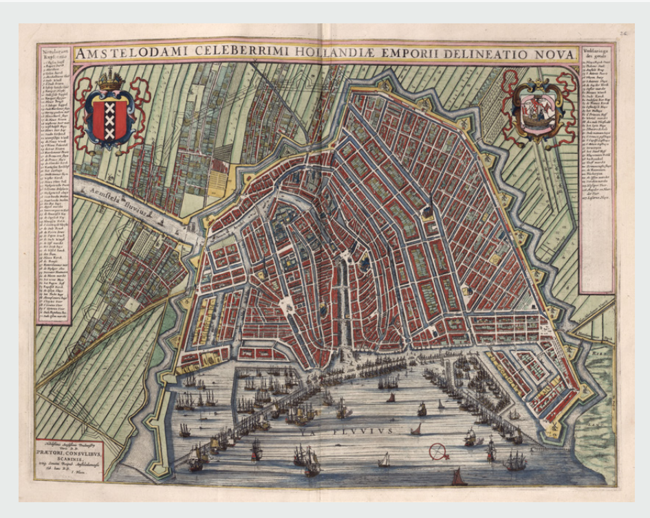
Figure 6: Amstelodami Celeberrimi Hollandiae Emporii Delineatio Nova ("New Delineation of Amsterdam, Holland's Most Famous Trading Port"), plate 26 in Joan Blaeu's Toonneel der Steden van de vereenighde Nederlanden ([1652?]b). The original is 41 × 54 cm (16 × 21 in) (Van der Krogt 2010, 688–689, entry 110, which lists it as plate 23 ijE in vol. 1). Beside the lists of landmarks that frame the map on the upperright and upper-left is the coat-of-arms of Amsterdam (left), and a shield with a sailing vessel (right). The compass in the lower right indicates that the map is oriented southwest—the typical orientation favored since the sixteenth century (687–693, figs. 107–111, 122–135)—with the town pictured above the U inlet [YA Fluvius] that gave Amsterdam access to the world. The colors of this map accord with the "red, green & guinea-yellow" description in Slessor's poetry notebook (April 1, -s86). Courtesy of the Library of Congress, Geography and Map Division (G1851 .B52 1652).

Despite differences in size, orientation, perspective, and quantity of features, the maps of Flushing and Amsterdam nevertheless resemble one another closely. Both show water and ships filling the bottom, while the town floats above. Blocks of buildings, seen from overhead, are separated by canals and surrounded by fortifications, moats, and gardens. Although Slessor claimed that "bolted shadows, row by row/float changeless on the stones below," shadows are notably absent from the perspective plans lest they muddy the geometric precision of the streets. Yet Slessor has captured the elevation of turrets and mansions "lean