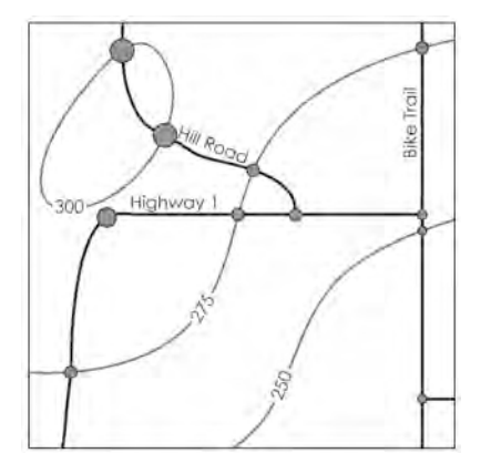
Figure 6. An example of a road network. (see page 91 for color version)

In order to create line segments that gradually and evenly change width, the project is next taken into Adobe Illustrator, where the Blend tool is used. This tool fills in the space between two objects with intermediate steps, to create a smooth transition, as in Figure 7. In this case, the intermediate circles are changing size to blend from one point of known elevation to another. Hundreds of steps in the transition may be