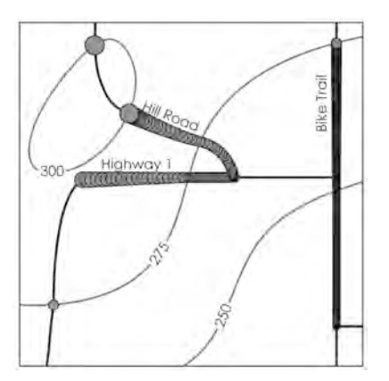
Figure 7. A sample of using the Blend tool in Adoble Illustrator. (see page 91 for color version)

needed in order to give the appearance of a solid line, as seen on the right-hand side of the figure. Blends can also be done along a curved path to help better represent the shape of the underlying road. Once the blend has been performed, the circles can be merged together into one simple, rounded line segment. The segments can them be joined into a complete route. The joints will be smooth and rounded, because the segments are based on circles.